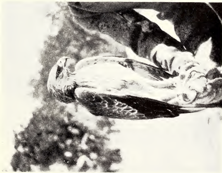
BONELLI'S EAGLE ( Hieraëtus fasciatus )